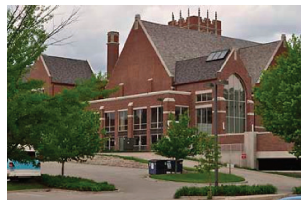
Plymouth's Educational Wing

Roddy Dunkerson of Nebraska feels it is hard to talk about this form of transition apart from the people involved. Other Conferences have called him to learn about First-Plymouth's process. "I try to emphasize the particularities," he says. "Each case will be different. There is no