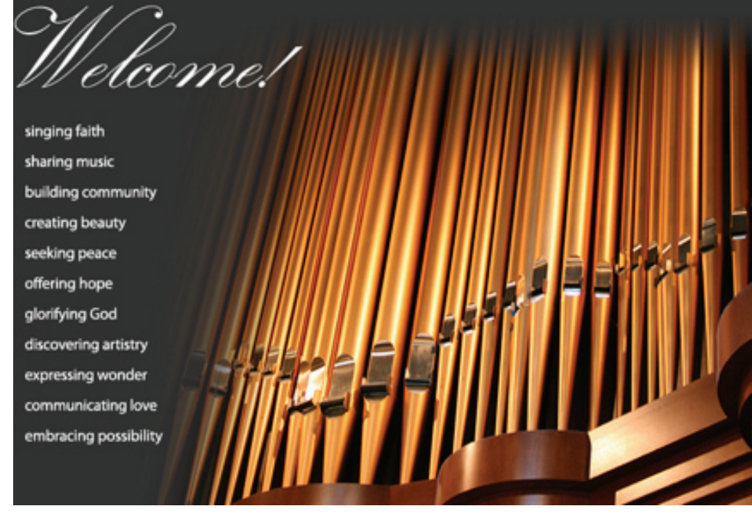
The First-Plymouth Organ

The church is an enormously complex operation with four services on Sundays on the church's campus, a service on Saturday evening and an experimental Sunday service at a school in East Lincoln. Six choirs supply music for over 250 worship services each year. Hundreds of children and adults participate in an extensive education program, and in a typical year members performed volunteer services in Honduras, Guatemala, Missouri and the Pine Ridge reservation. The church's programs range from an animal ministry, to a ministry of sustainability, to the Plymouth Pride Fellowship, a gathering of gay, lesbian, bisexual, transgender or questioning (GLBTQ) community members and their friends. The church's television ministry, "Reach Out and Live," is broadcast on the local Fox cable channel in Omaha and on the NBC station in Grand Island and reaches